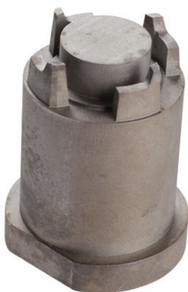
Printed mold component after printing with no-post processing

A global manufacturer of consumer appliances replaced an existing plastic injection mold component in a high-volume dishwasher mold with a component printed using Mantle technology. The part took 46 hours to print using Mantle's TrueShape™ process, compared to a lead time of 1 week with conventional manufacturing, a 71% time savings. The Mantle insert quality was equivalent to traditionally-manufactured inserts, with dimensional tolerance within 0.001" and a smooth surface finish. The insert was ready for molding without additional surface finishing. The evaluation led to a full production run of 200,000 parts and continues with another 200,000 part run, which is currently underway. The replacement printed insert cost was 67% less than the cost of the same insert produced using traditional methods.